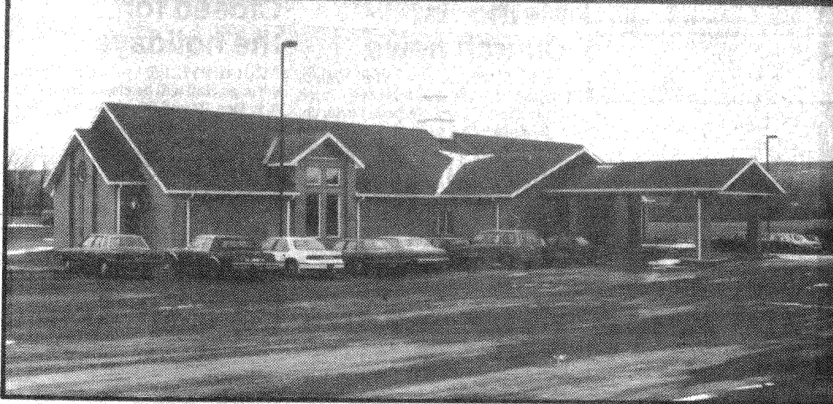
NEW CHURCH — The beautiful new Christ United Lutheran Church, built on the former home of the Gordon airport, will be dedicated with a special service on Sunday, Dec. 27. The top photo provides an inside view of the sanctuary while the bottom photo captures the overall view of the facility.